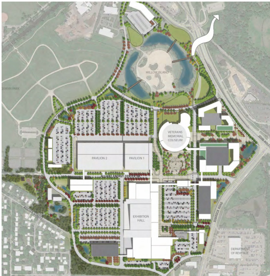
ALLIANT ENERGY CENTER MASTER PLAN

Master planning DEFINES a clear path for your future, DETERMINES your needs and goals, and ESTABLISHES a plan to accomplish it.