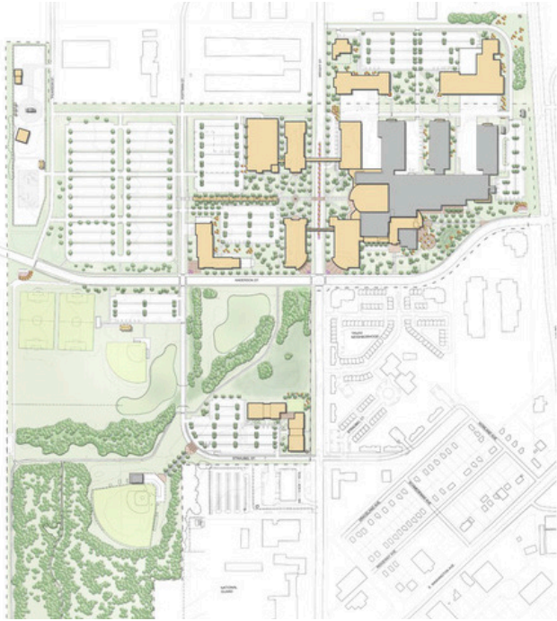
MADISON COLLEGE TRUAX CAMPUS CONCEPT